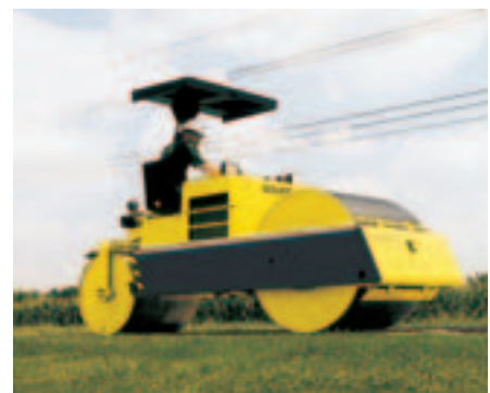
Especially designed for all types of asphalt compaction