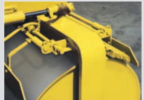
Each drum has a full width cocoa mat, two scraper bars that clean in both travel directions, and four spray nozzles