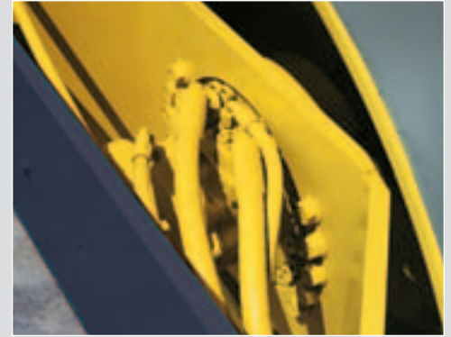
The full hydrostatic drive with a low-speed, high-torque motor delivers smooth acceleration, deceleration and directional changes.