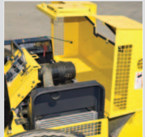
The engine location is low in the frame for ease of service and operator visibility

With these features and many more, it's easy to see why this model maintains a high residual value while delivering lower lifetime operating costs.