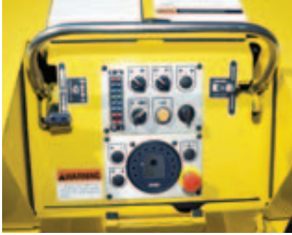
Controls are placed for natural operator movements