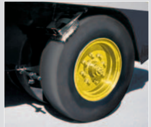
Cocoa mats on each tire help eliminate material pick-up