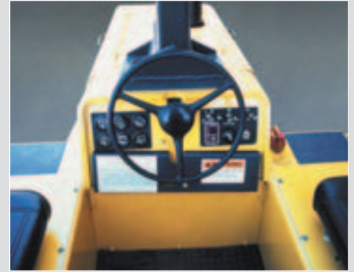
Cockpit design places controls within easy reach and provides unobstructed visibility