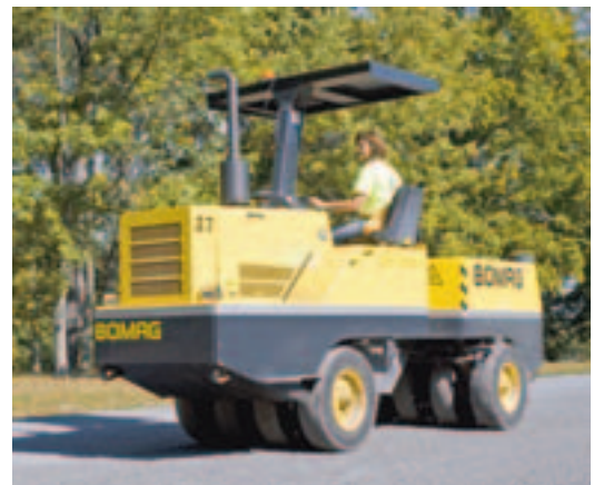
BW11RH in action on an asphalt resurfacing application