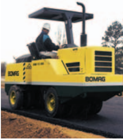
Dual, center facing seats provide excellent visibility in both travel directions