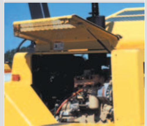
Easy access means fast servicing

With these features and many more, it's easy to see why this model maintains a high residual value while delivering lower lifetime operating costs.